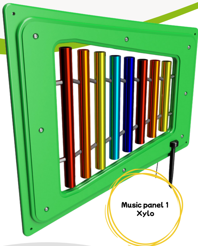
Music panel 1 Xylo