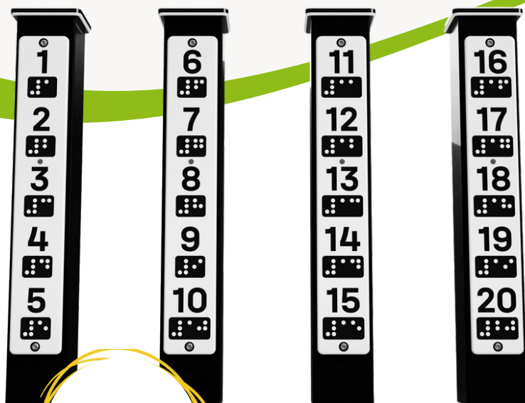
Braille Post Set